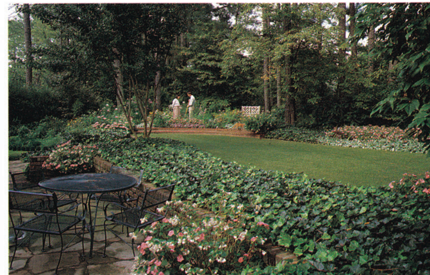
(Above) The lawn offers a smooth foreground to the rest of the garden, yet its size and shape are easy to maintain. (Left) A flagstone terrace and brick wall were original to the garden; the rest is Smith's design.