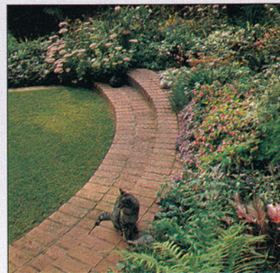
Steps make a gentle transition between the lawn and perennial bed.